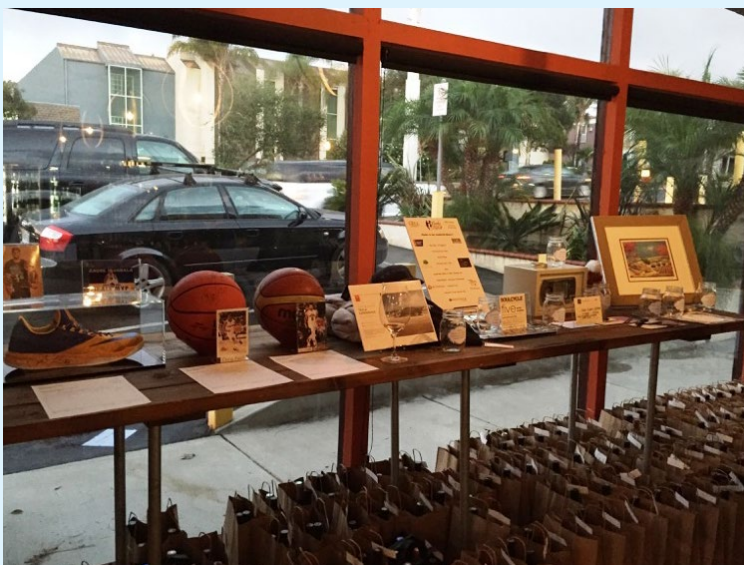
The silent auction table at the event.