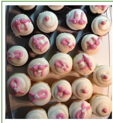
Even the cupcakes got into the spirit!