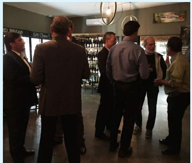
Guests mingle at the wine tasting