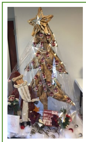
The amazing Administration wine-themed basket.