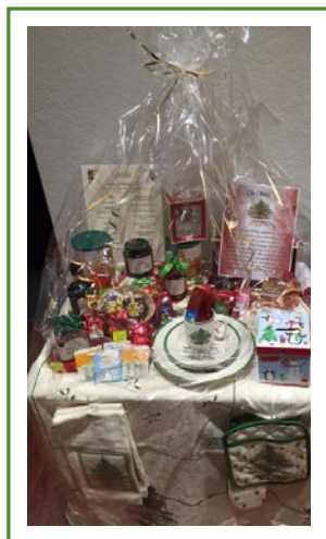
The C.A.R.E. & Research Dept. basket featured a 6-place setting of Spode Christmas plates with accompanying accessories.

employees really stepped up as usual, and raised $1,325 for patient financial assistance in Southwest Florida!