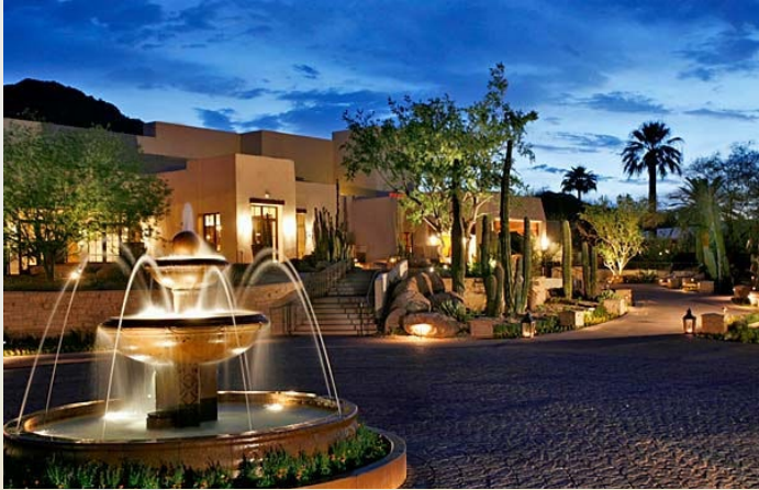
The beautiful Camelback Inn Resort & Spa