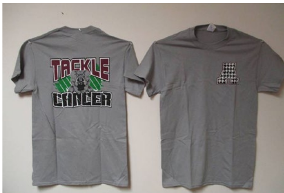
The back and front of the University of Alabama t-shirt.