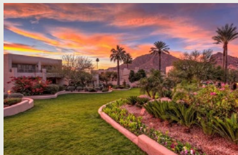
The beautiful Camelback Inn Resort & Spa